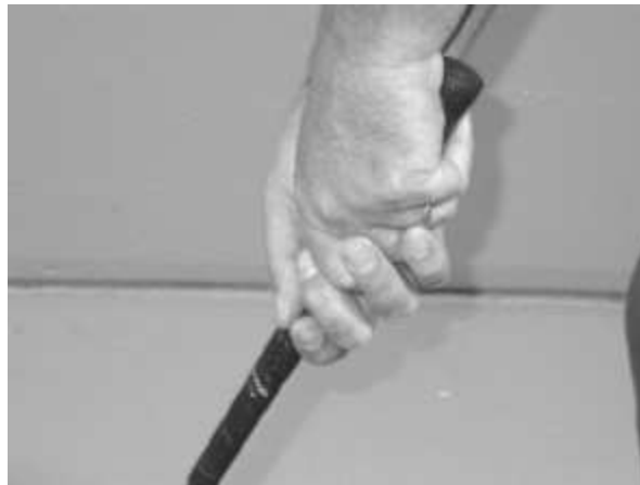
Note The "Pinch" With The Two Fingered Overlap Grip