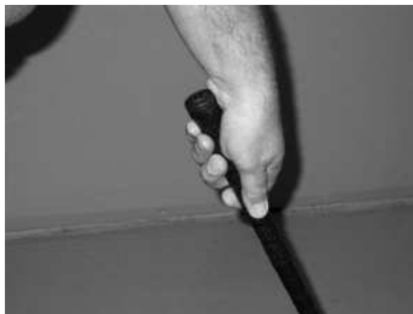
Club in middle of palm