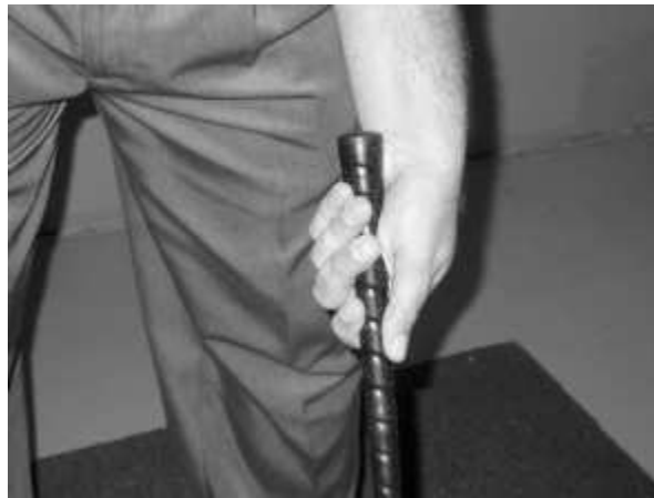
The thumb pad positioned at the back of the club

Your thumb and the large pad at the base of your thumb should be against the grip at the 2 o'clock to 3 o'clock position (for a right handed golfer) on the back side (away from the target) of the grip. The pad at the base of your top hand index finger should be right on the top of the shaft.