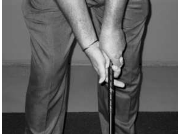
The Two Finger Overlap Grip

With all the grips it is very important that the thumb and index finger of the bottom hand are “pinched” together. The fingerprint pad (opposite the thumb nail) of your bottom hand thumb should be resting against the fingerprint pad of the bottom hand index finger. You are in effect pinching your thumb and first finger together around the club. The purpose of this “pinch” modification is to slightly weaken the tendency of the bottom hand to tense up and overpower the top hand and roll it over closing the clubface at impact.