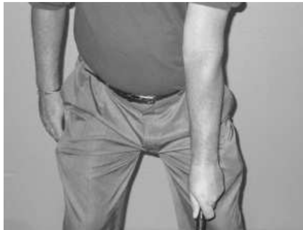
Thumb at 3 o'clock position

1. Extend your left arm down again with your elbow joint on-plane. Grab the club in a pinching motion between your thumb and index finger. The back of your hand (near your index finger) will point almost straight up (12 o'clock position).