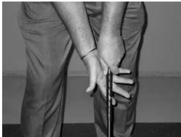
(The Top Thumb Fits In The Groove)

Your thumb and the large pad at the base of your thumb should be against the grip at the 2 o'clock to 3 o'clock position (for a right handed golfer) on the back side (away from the target) of the grip. The pad at the base of your top hand index finger should be right on the top of the shaft.